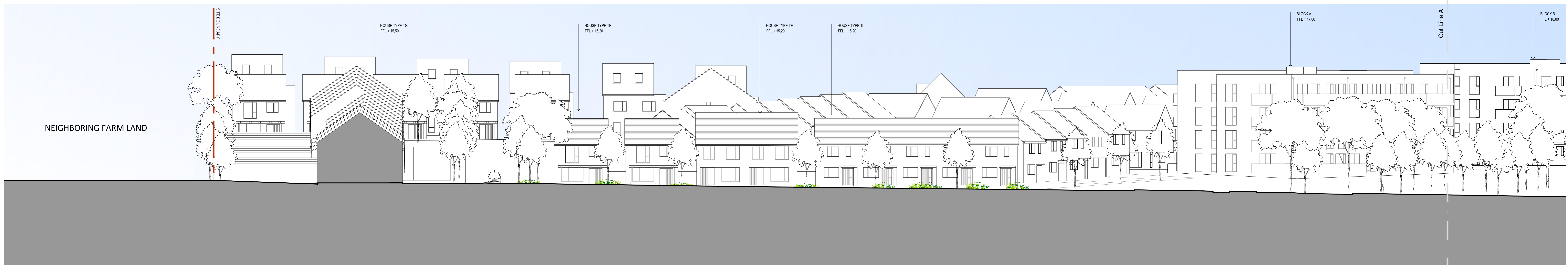
Site Section C-C, Part 1 of 2 scale 1:200