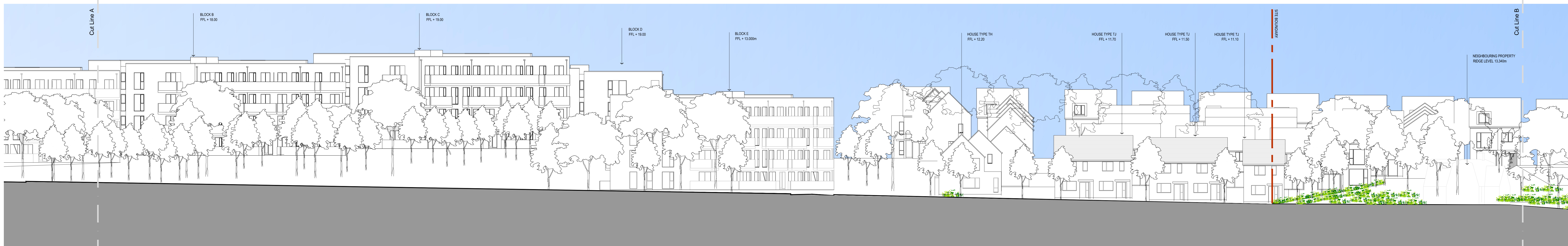
Site Section C-C, Part 2 of 2 scale 1:200